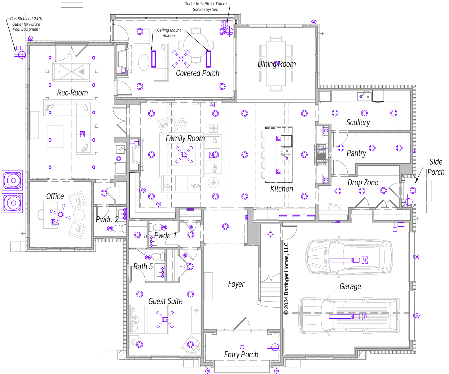
Main Level - Electrical